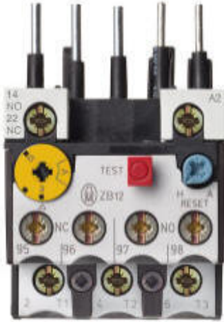
(ZB12-12 shown, actual part may vary)