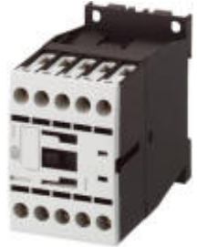
DILM Contactors for ZB12 Overloads